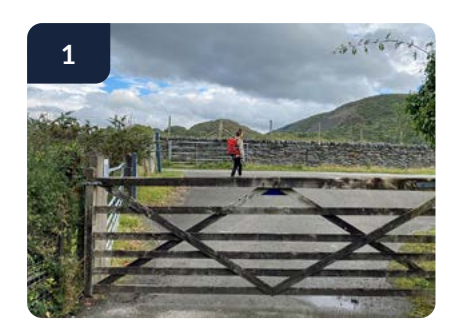
From the car park, turn right and walk along the road for about 100 metres to a public footpath on your left.