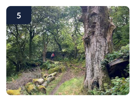
Follow the wooland path to the right to the top of the hill passing an enormous, old beech tree on your right. Go over the stile in the wall and continure along the path to the left, following the river for about 500m to a wooden stile and farm track.