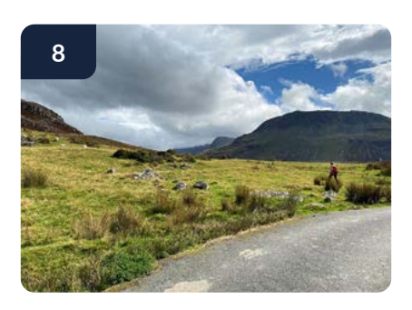
At the waymaker at the top of the hill, you will see Cregennen lakes below. Follow the path to the left until you reach a stile in the wall. Go over the stile and continue along the path over rough heathland. To your left are the foothills of the Pared y Cefn-hir.