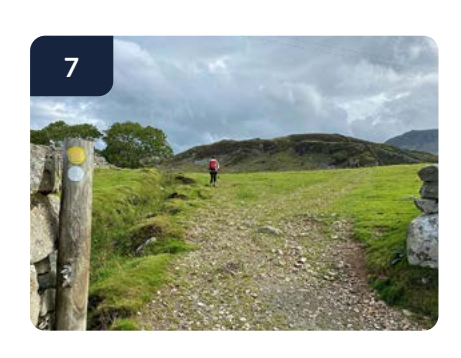
After the second farm gate, bear left following the waymarkers past a ruin and along the boundary wall aiming for the stile near the large boulders you can see in the distance. Go over the stile and follow the footpath and waymarkers untill you reach a road. Turn right and walk up the road for about 650 metres.