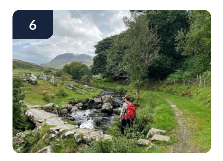
Go over the clapper bridge to join a farm track. Enjoy the view of Tyrrau Mawr. Turn left and continue along the track through two farm gates.