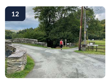
At the bridge, follow the public footpath to the right, keeping the river (Afon Gwynant) on your left. Keep left following the track though Abergwynant woods to the Mawddach Trail.