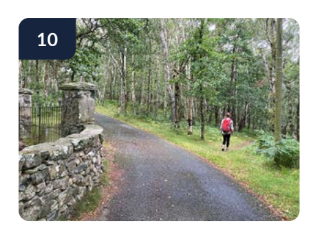
Follow the path to your right, opposite the chapel, down through the woods to rejoin the road above the Kings Youth Hostel. Walk along the road for about 1.5km.