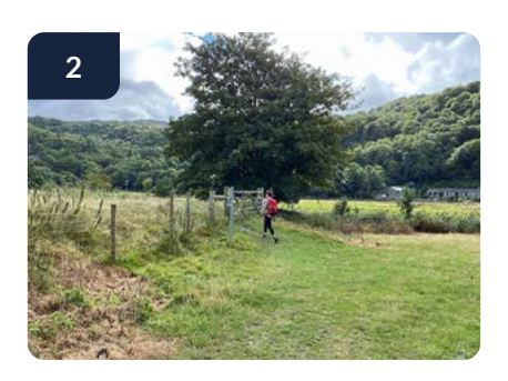
Go through the gate on your left, following the National Park waymarkers. Follow the path along the embankment and through the field towards St Catherine's Church and a kissing gate.