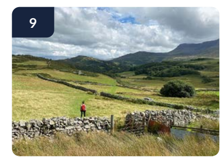
Continue along the path to a farm gate above Ty'n Llidiart farm. Go through the gate and cross the fields to join a farm track. Turn left and follow the track down the valley to a country lane. Follow the road to the left for about 200 metres. You will reach the remains of a chapel on your left.