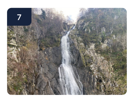
The path can be a bit rough here so take care. You will soon reach the waterfall. To return, follow your steps back to the car park.