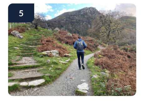
Follow the path for approximately 0.5km until you come to a fork. Bear right here to continue along the accessible path.