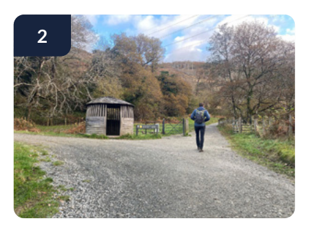
Continue along the path, following the yellow waymarkers, until you reach a wooden hut. Go past the hut and through the wide gates.