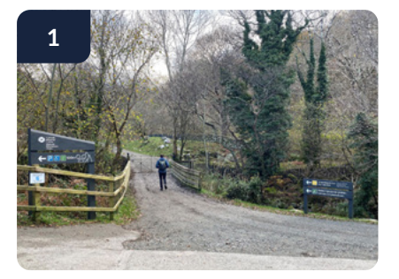
Start your journey by crossing a small bridge leading to a wide gate. This starting point is accessible. It is signposted as 'Suitable for pushchairs'.