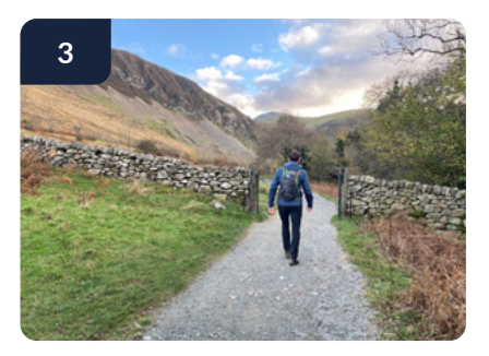
As the path starts to ascend, you will reach a flat grassy area along with an opportunity to enjoy the view down the valley. You will soon reach Bwthyn y Nant cottage on your left.