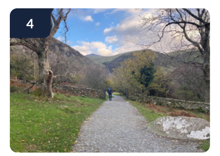
The path continues, and you will pass two iron gates.