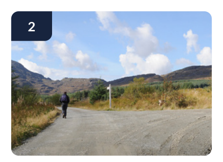
After about 200m on the gravel road, bear left at the first junction.