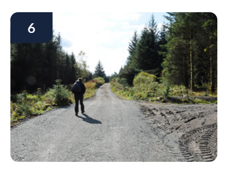
After a while, go straight ahead passing the turning on your right.