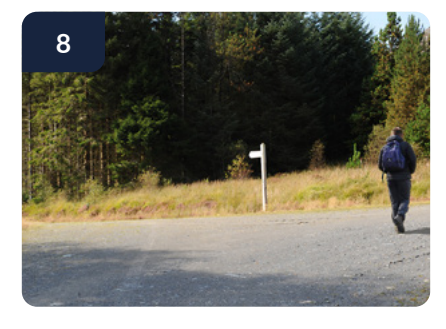
At the next junction, follow the track to the right ignoring the wooden sign at Bwlch Drws Ardudwy.