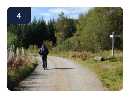
You will soon see a sign on your right towards Bwlch Tyddiad. Continue following the Bwlch Drws Ardudwy path.