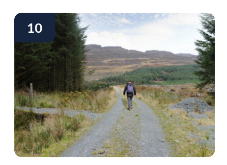
Follow the path through the plantation for a further 300m.