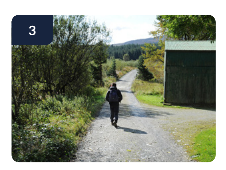
Be aware of the animals as you pass Graigddu Isaf on your right. Continue to the left of the farmhouse and cross the bridge straight ahead.