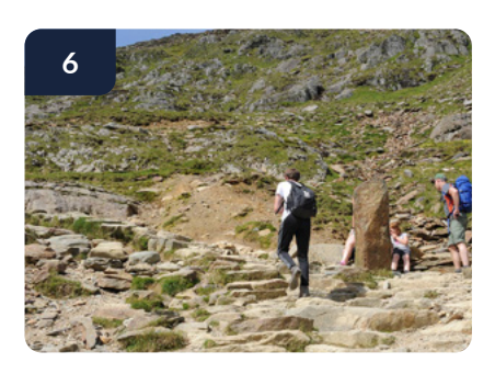
Shortly, you will reach a standing stone that marks the junction with the Pyg Track (remember about it on your way down). From this point the path continues to climb steeply and loose underfoot until you reach Bwlch Glas.