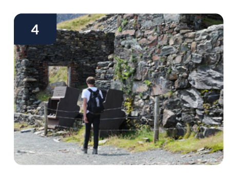
The ruins of the old crushing mill are near Llyn Llydaw, and amongst the remains are the large crushing hammers that were used to extract the valuable ores.