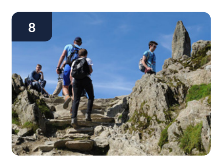
At Bwlch Glas, you will be joining the Llanberis Path and the Snowdon Ranger Path. This junction is marked with a standing stone (remember about it on your way down)