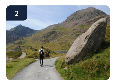
The path forks near Llyn Llydaw. Bear right and you will reach a causeway across the lake.