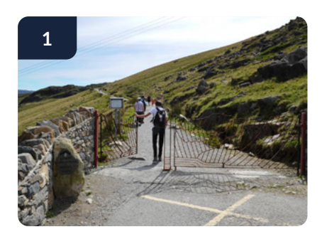
The path starts at the far left hand corner of the Pen y Pass car park, opposite the entrance.