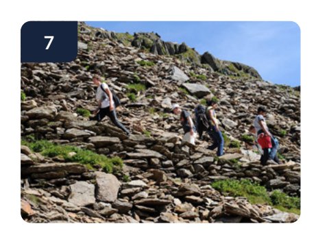
In a little while, the path will zigzag up to Bwlch Glas.