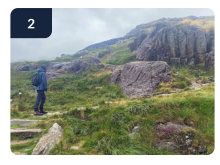
You will soon come to a rock and some stone steps – keep walking along the path.