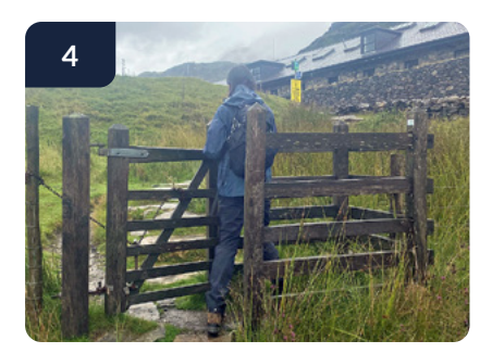
Go through the kissing gate. At this point, you could walk left to join the Miners' Track or right through the car park to join the Pyg Track.