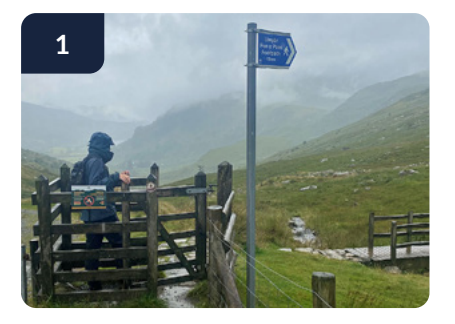
When leaving your car, head along the right-hand side of the road towards Nant Gwynant. Go through the wooden kissing gate and bear right. Cross the wooden bridge and follow the path towards Pen y Pass.