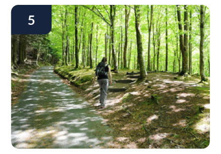
You will soon reach another signpost. Follow the path along the ravine back to the route's start.