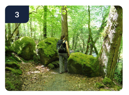
Further down the ravine, you will see three large boulders across the path. Glacial forces carried the boulders here nearly 10,000 years ago. Important collections of lichens and liverworts also grow here.