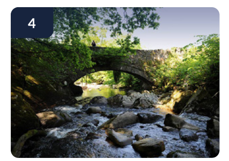
Soon, you will reach the lower road. Turn right over Pont Clywedog. Notice the names carved into the bridge's stones. Walk past the old Mill entrance. These buildings on your right were previously a woollen mill and warehouse. Take the right turn opposite Clywedog Lodge up the narrow, steep wooded road.