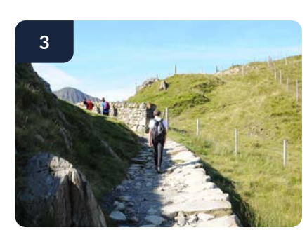
After about an hour's walking you will reach Bwlch y Moch