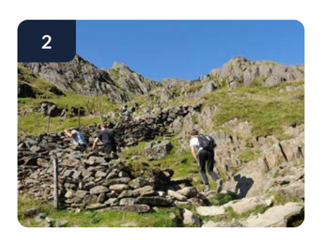
The first section of the Pyg Track climbs quite steeply over rough and rocky terrain. Tread carefully to avoid an ankle injury, especially on your way down.