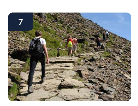
In a little while, the path will zigzag up to Bwlch Glas.