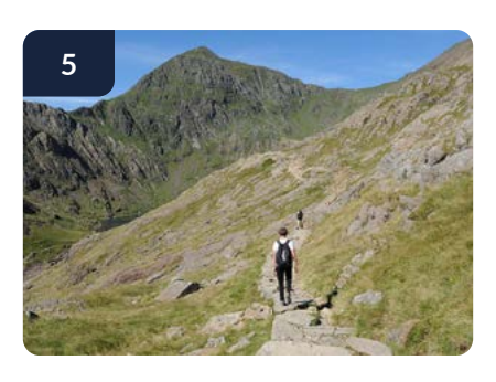
From Bwlch y Moch the path climbs gradually to the intersection of the Pyg and Miners' Track above Glaslyn.