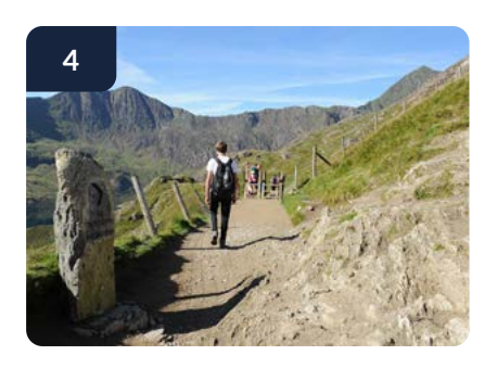
As you reach Bwlch y Moch, Llyn Llydaw will come into sight below. The slopes of Lliwedd rise above the far side of the lake. The path forks here, with the path on the right leading up Crib Goch. For Snowdon, bear left and over the two adjacent stiles.