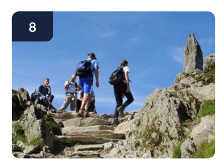
At Bwlch Glas, you will be joining the Llanberis and Snowdon Ranger Path. This junction is marked with a standing stone - remember about it on your way down.