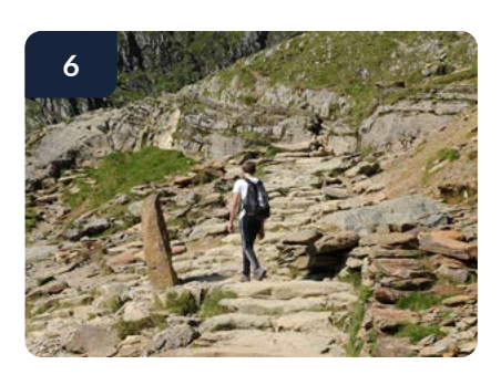
The spot where the Pyg and Miners' Track meet is marked by a standing stone – remember about it on your way down. From this point the path climbs steeply until you reach Bwlch Glas.