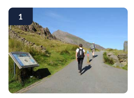
The path starts in the far end corner of Pen y Pass car park, to the right of the car park's entrance. Pass the helicopter landing site on your right and go through a narrow gap in a stone wall. (The prominent path that starts opposite the car park entrance is the Miners' Track).